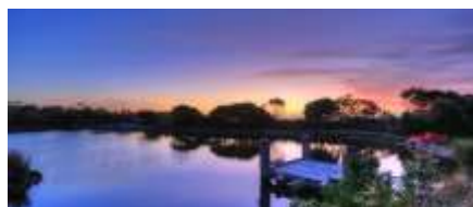
Stanley Lakeside Spa Cottages